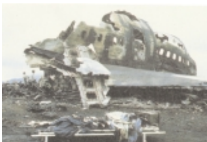
Boeing 747 Tenerife Accident

perhaps a misunderstood radio call! The Pan Am aircraft had been asked by the controller, who was unable to see either aircraft due to low cloud, 'Are you CLEAR of the runway?' The KLM aircraft had already commenced the take-off roll without clearance; could the KLM pilot have mistaken the call to the other aircraft thinking that he was 'CLEAR to Take-Off?' The answer remains a mystery, the cure is straightforward; use the correct RTF phraseology which is designed to be unambiguous, acknowledge and read back all clearances and above all, if in doubt ASK!!